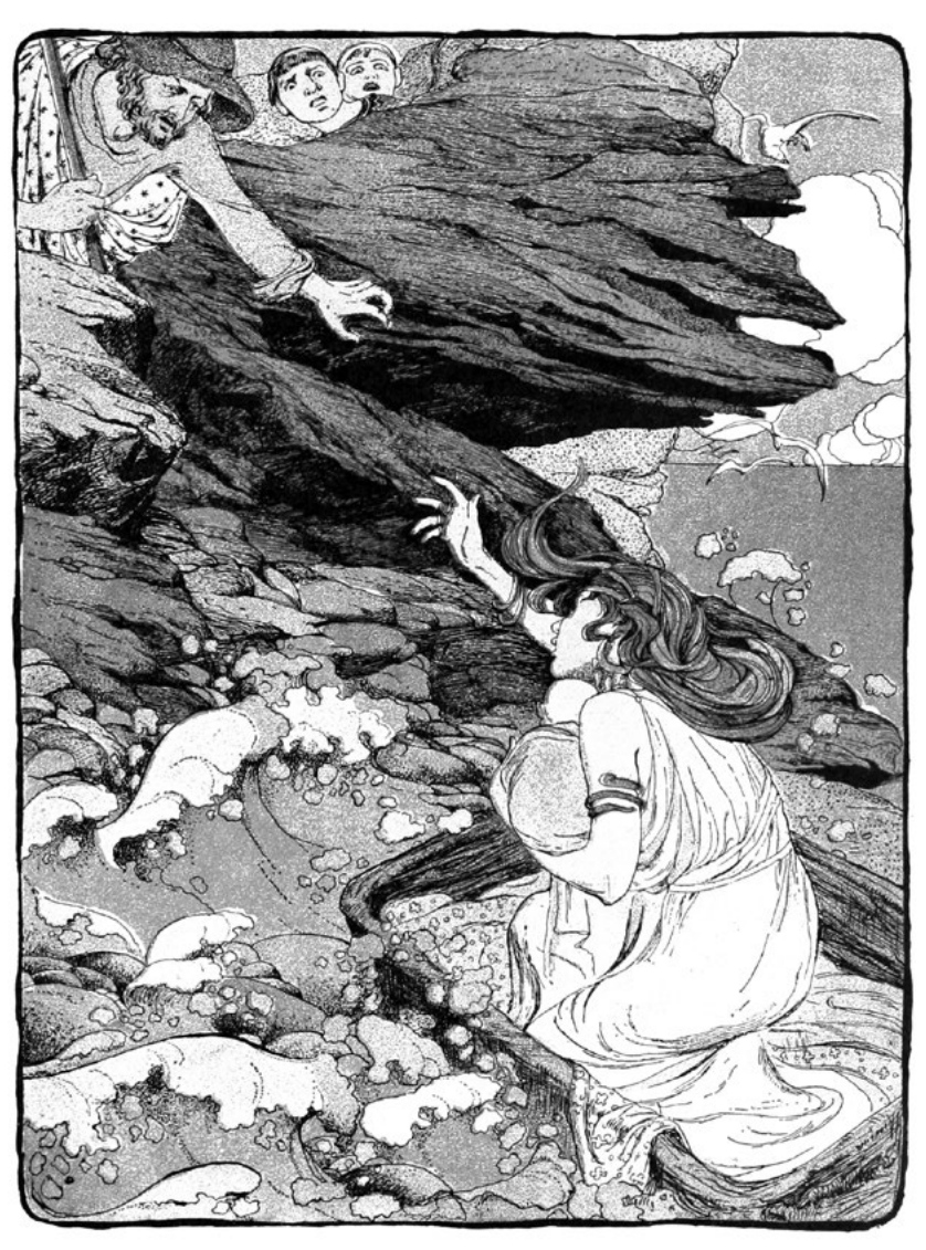
When she cried, help met her.