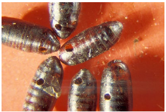
These pupae were killed by parasitic wasp larvae

tle claws become infested with disease germs; and when it stops some day to clean up on our table, it leaves the germs with us. Thus our only safety lies in the final extermination of this little nuisance.