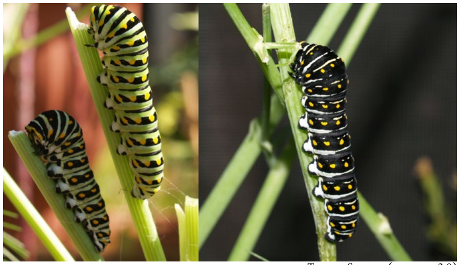
Color variations in the black swallowtail catterpillar

creatures with straws to see them push forth their brilliant orange horns. We knew this was an act of resentment, but we did not realize that from these horns was exhaled the nauseating odor of caraway which greeted our nostrils. We incidentally discovered that they did not waste this odor upon each other, for once we saw two of the fullgrown caterpillars meet on a caraway stem. Neither seemed to know that the other was there until they touched; then both drew back the head and butted each other like billy-goats, Whack! whack! Then both turned laboriously around and hurried off in a panic.