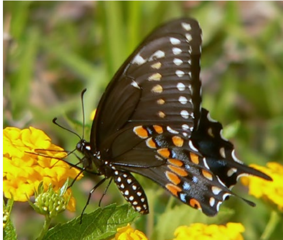
Side view of female swallowtail