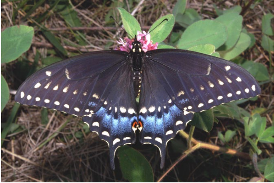
Kenneth Dwain Harrelson (cc by-sa 3.0) A female black swallowtail butterfly