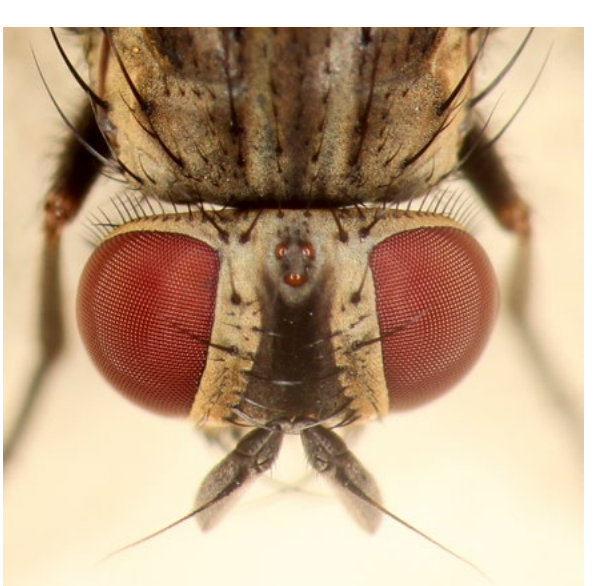
The eyes and head of a housefly

I have always held nature-study that should follow its own peaceful path and not be the slave of economic science. But occasionally it seems necessary, when it is a question of creating public sentiment, and of cultivating public intelli-