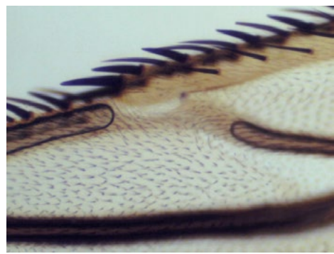
House-fly wing magnified 250x

ered with hairs that excrete at the tips, a sticky fluid. Because of the hairs on its feet, the fly becomes a carrier of microbes and a menace to health