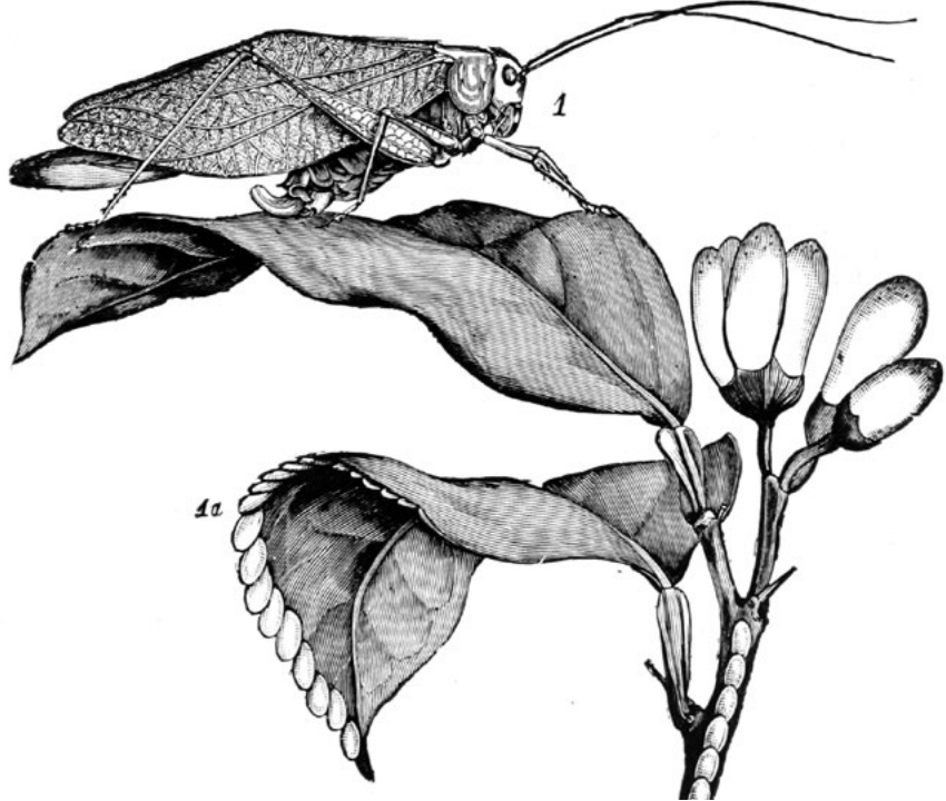
The angular-winged katydid and her eggs

cess of these lengthy ablutions, we must conclude that the katydid is among the most fastidious members of the insect "four hundred."