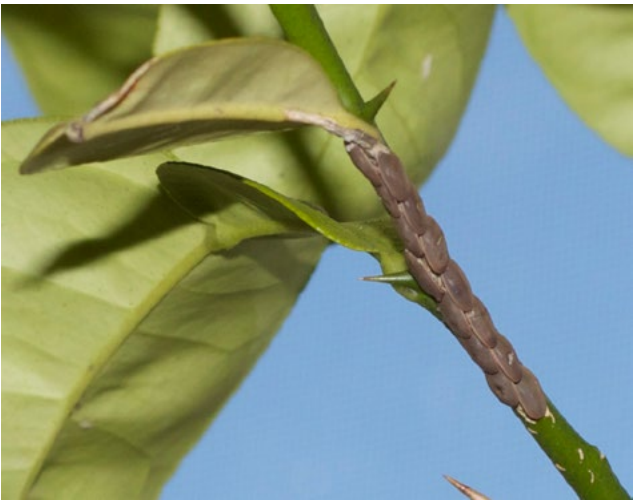
Katydid eggs attached in rows to a plant stem

The katydids are beautiful insects. with green, finely leaf-like veined.