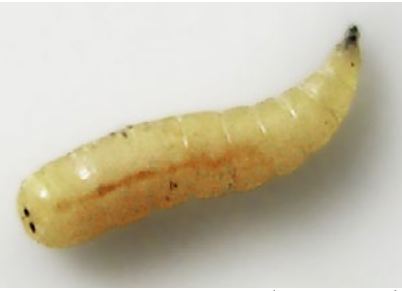
Housefly larva

Leading thought— The house-fly has conquered the world and is found everywhere. It breeds in filth and especially in horse manure. It is very prolific; the few flies that manage to pass the winter in this northern climate, are ancestors of the millions which attack us and our food later in