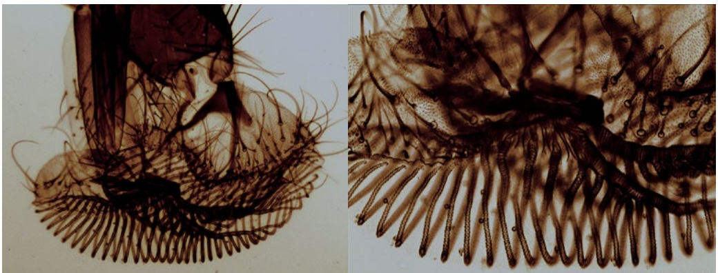
A housefly mouth magnified 40x and 100x

shining, simple eyes, which cannot be seen without a lens. Its antennae are peculiar in shape, but are evidently sense organs; it is attracted from afar by certain odors, and so far as we can discover, its antennae are all the nose it has. Its mouth-parts are all combined to make a most amazing and efficient organ for getting food; at the tip are two flaps, which can rasp a substance so as to set free the juices, and above this is a tube, through which the juices may be drawn to the stomach. This tube is extensible, being conveniently jointed so that it can be folded under the "chin" when not in use. This is usually called the fly's tongue, but it is really all the mouth parts combined, as if a boy had his lips, teeth and tongue, standing out from his face, at the end of a tube a foot long.