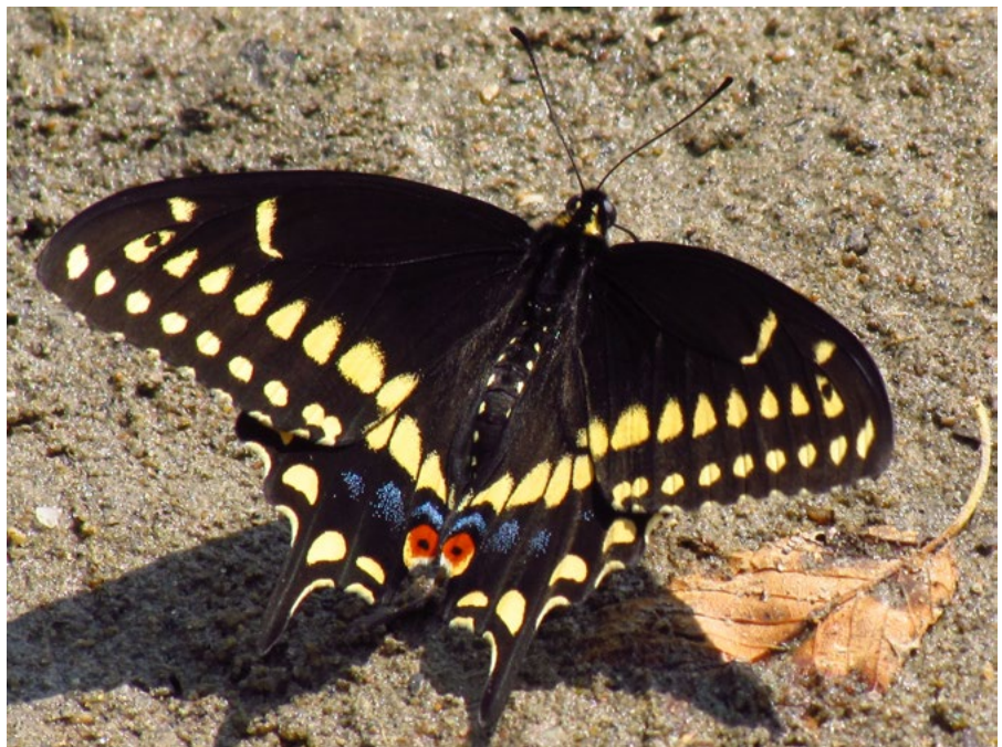
Male black swallowtail The Black Swallow-Tail Butterfly