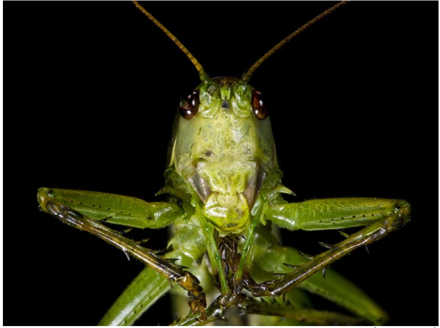
DIDIER DESCOUENS (CC BY-SA 4.0)

The katydids are almost all dwellers in trees and shrubs; although I have often found our common species upon asters and similar high weeds. The leaf-like wings of these insects are, in form and color, so similar to the leaves that they are very completely hidden. The katydid is rarely discovered except by accident; although when one is singing, it may be approached and ferreted out with the aid of a lantern.