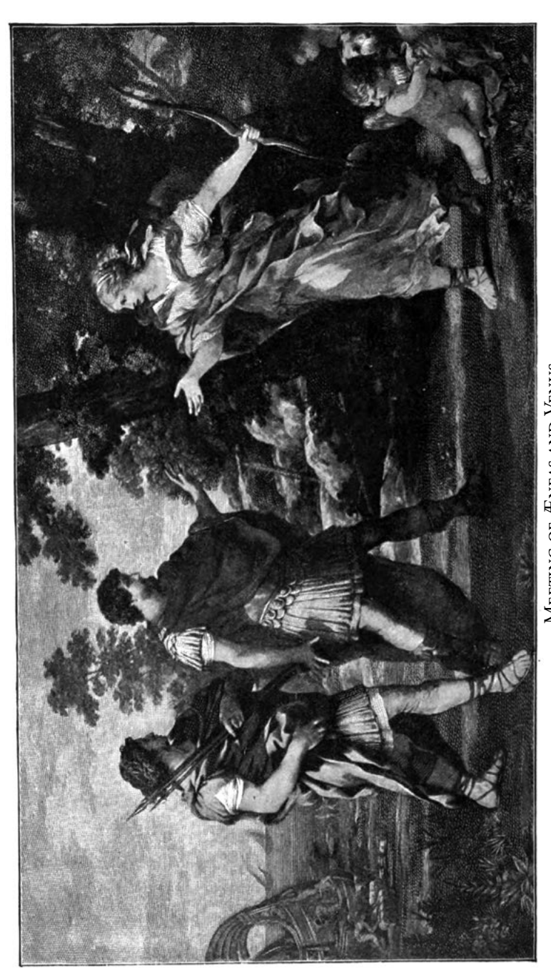
MEETING OF ÆNEAS AND VENUS.