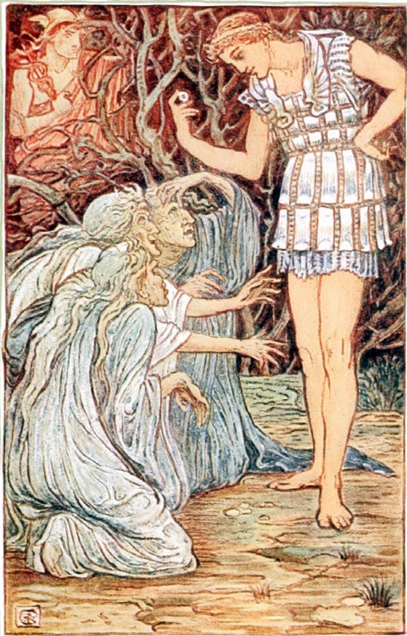
PERSEUS & THE GRAIÆ