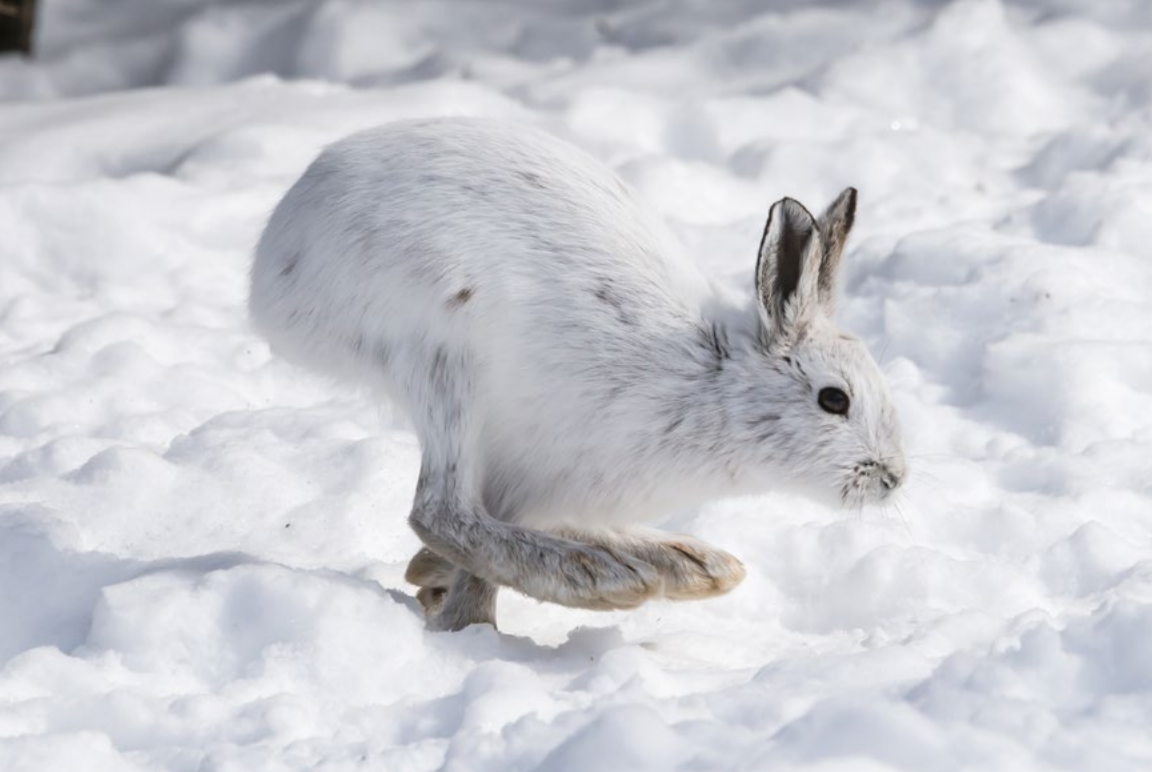
WHITE SNOWSHOE HARE.