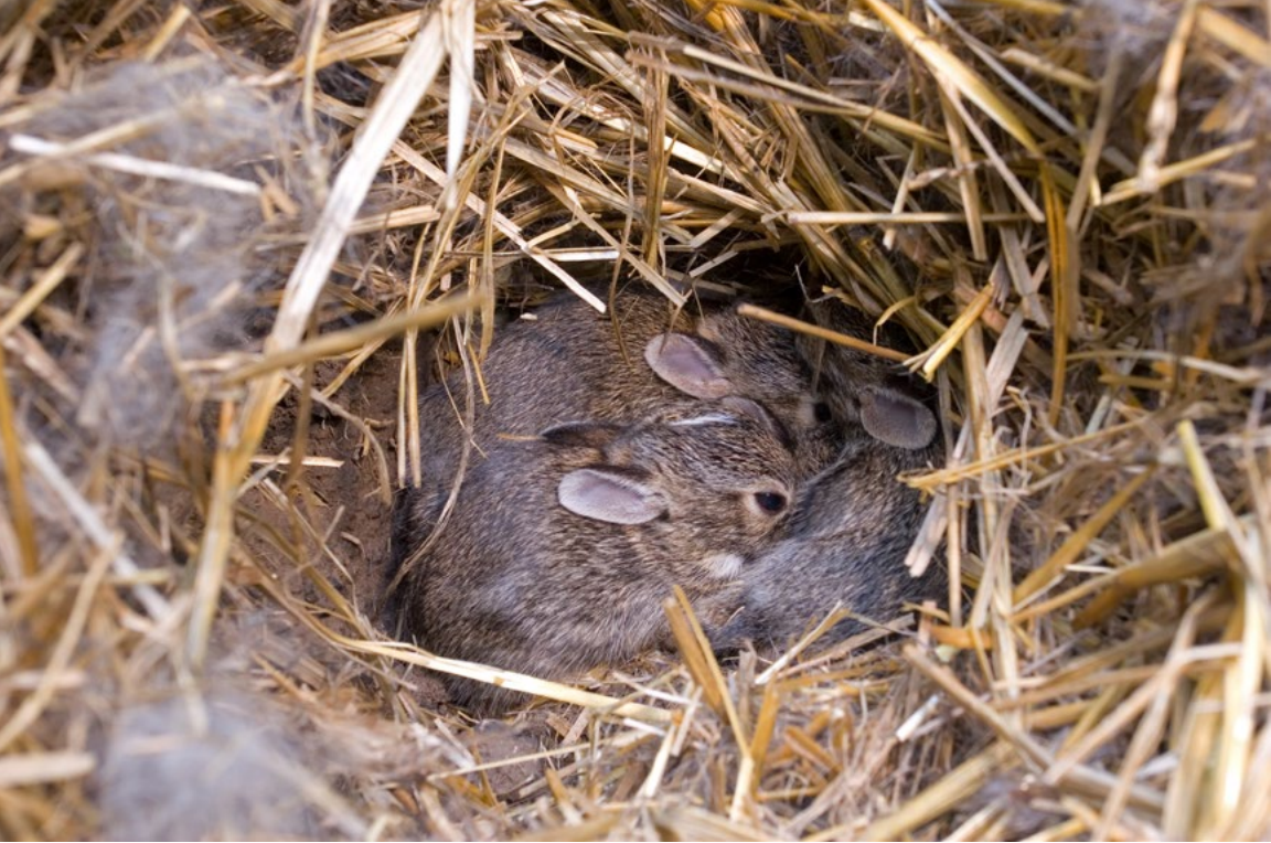
BABY COTTONTAIL RABBITS IN THEIR NEST.

“If you please, Mother Nature, why is that cousin of ours so fond of the water?” piped up Peter.