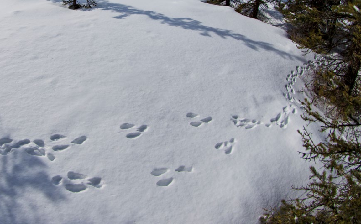
SNOWSHOW RABBIT TRACKS IN THE SNOW.

Jumper slowly shook his head. “Not unless it was to make me different,” said he.