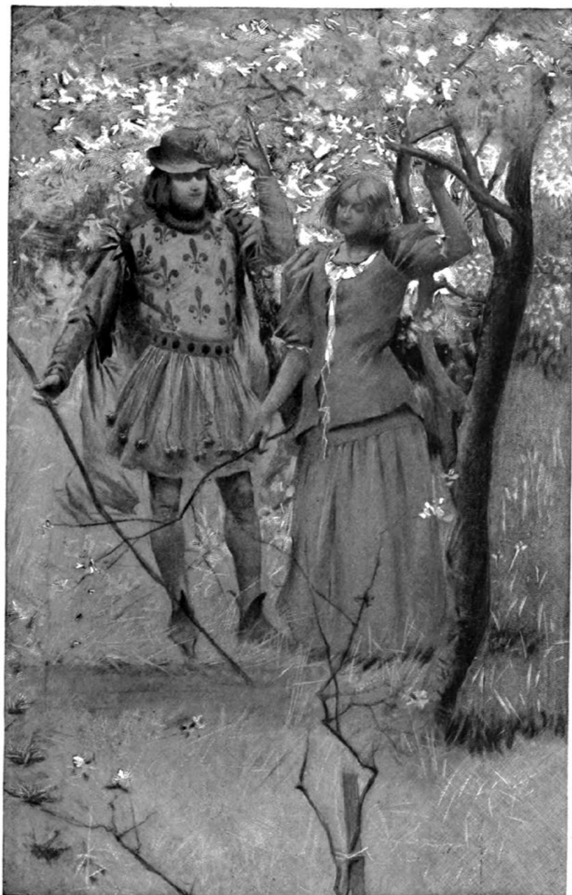
IN THE FOREST