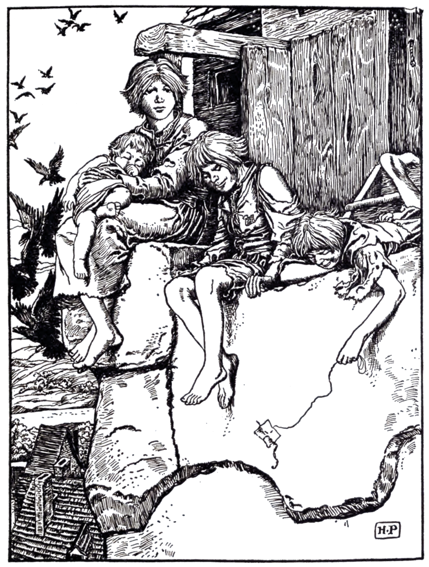
THERE THEY SAT, JUST AS LITTLE CHILDREN IN THE TOWN MIGHT SIT UPON THEIR FATHER'S DOOR-STEP.