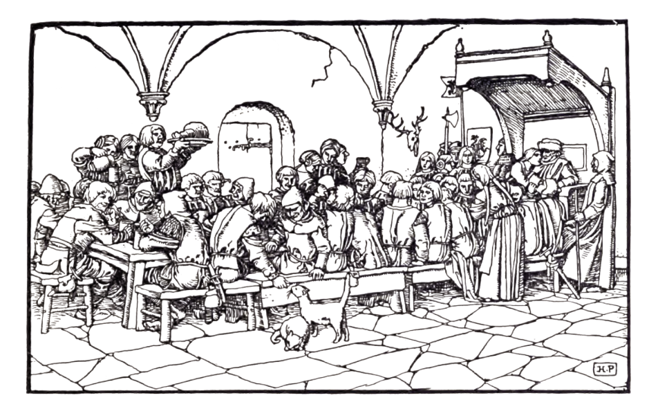
II. HOW THE BARON WENT FORTH TO SHEAR.