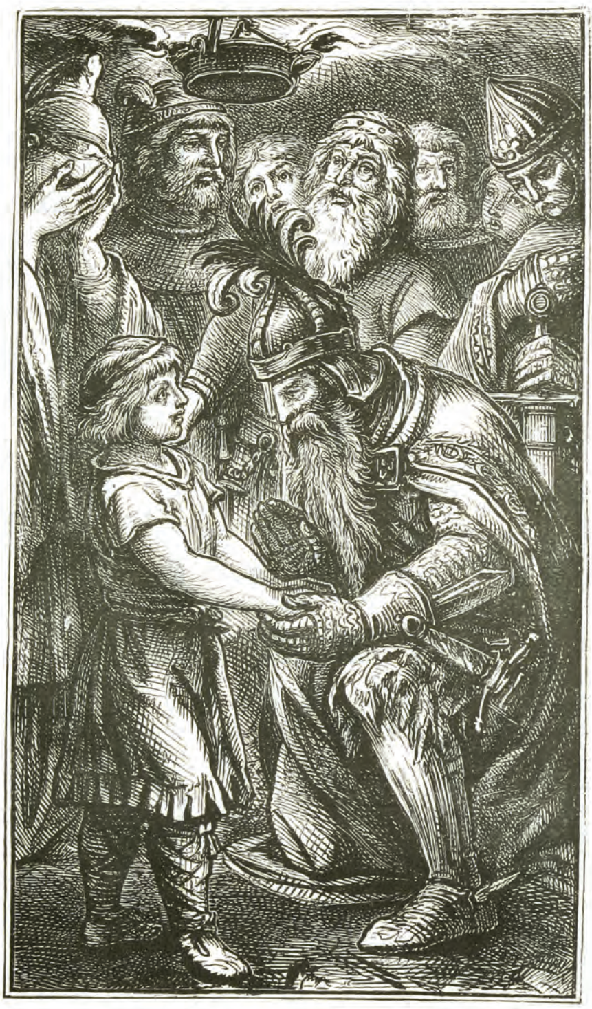
The oath of the vassals