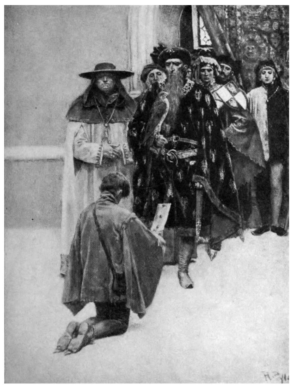
"Myles, as in a dream, kneeled and presented the letter"