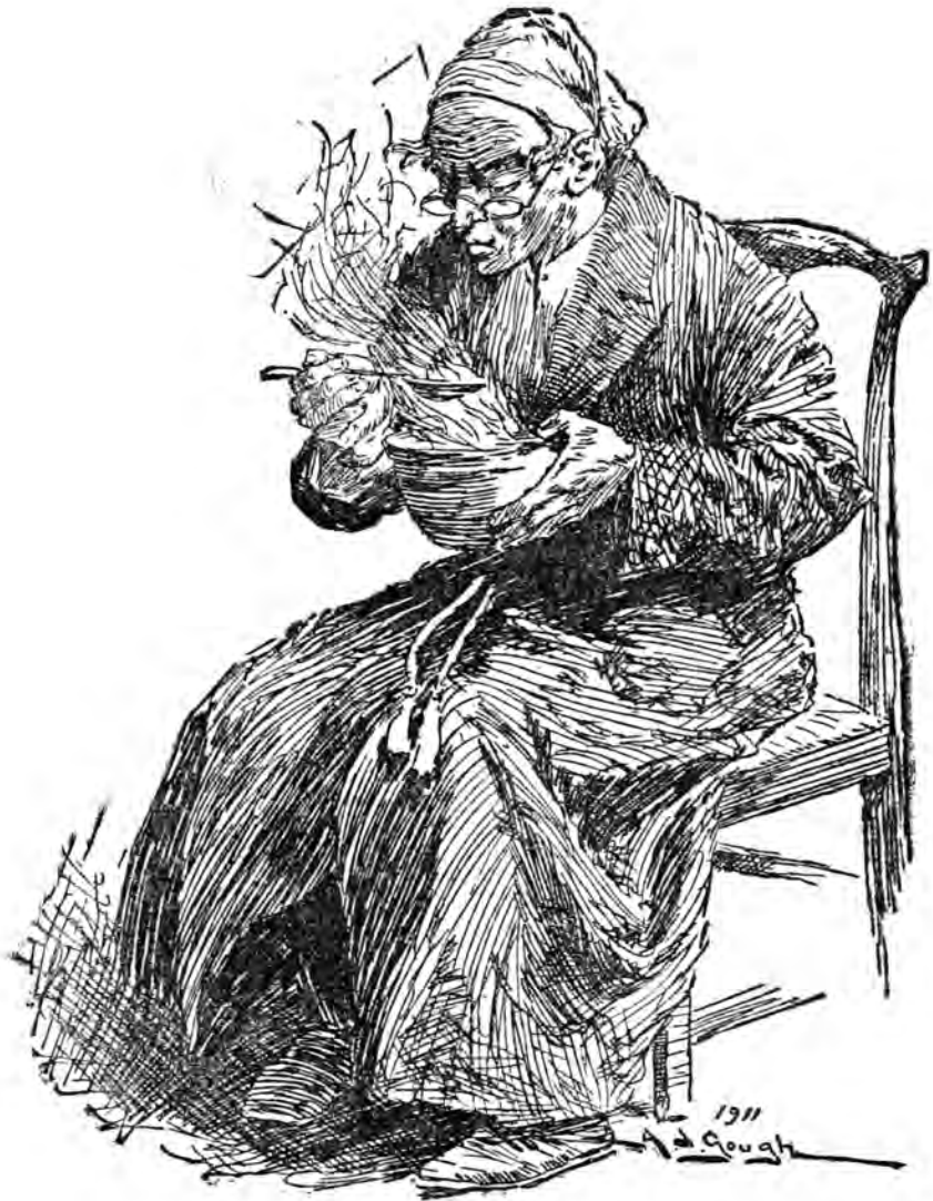
SCROOGE SAT DOWN BEFORE THE FIRE TO TAKE HIS GRUEL.