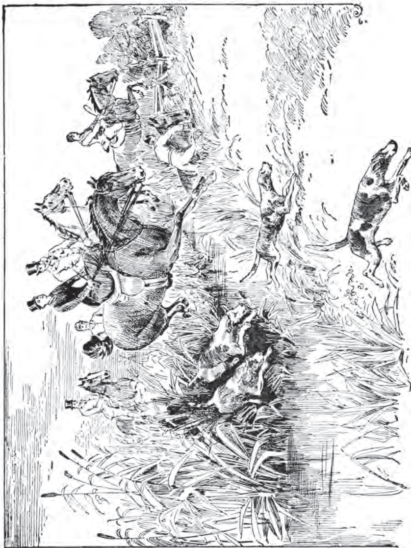
“MAKING STRAIGHT FOR OUR MEADOW”