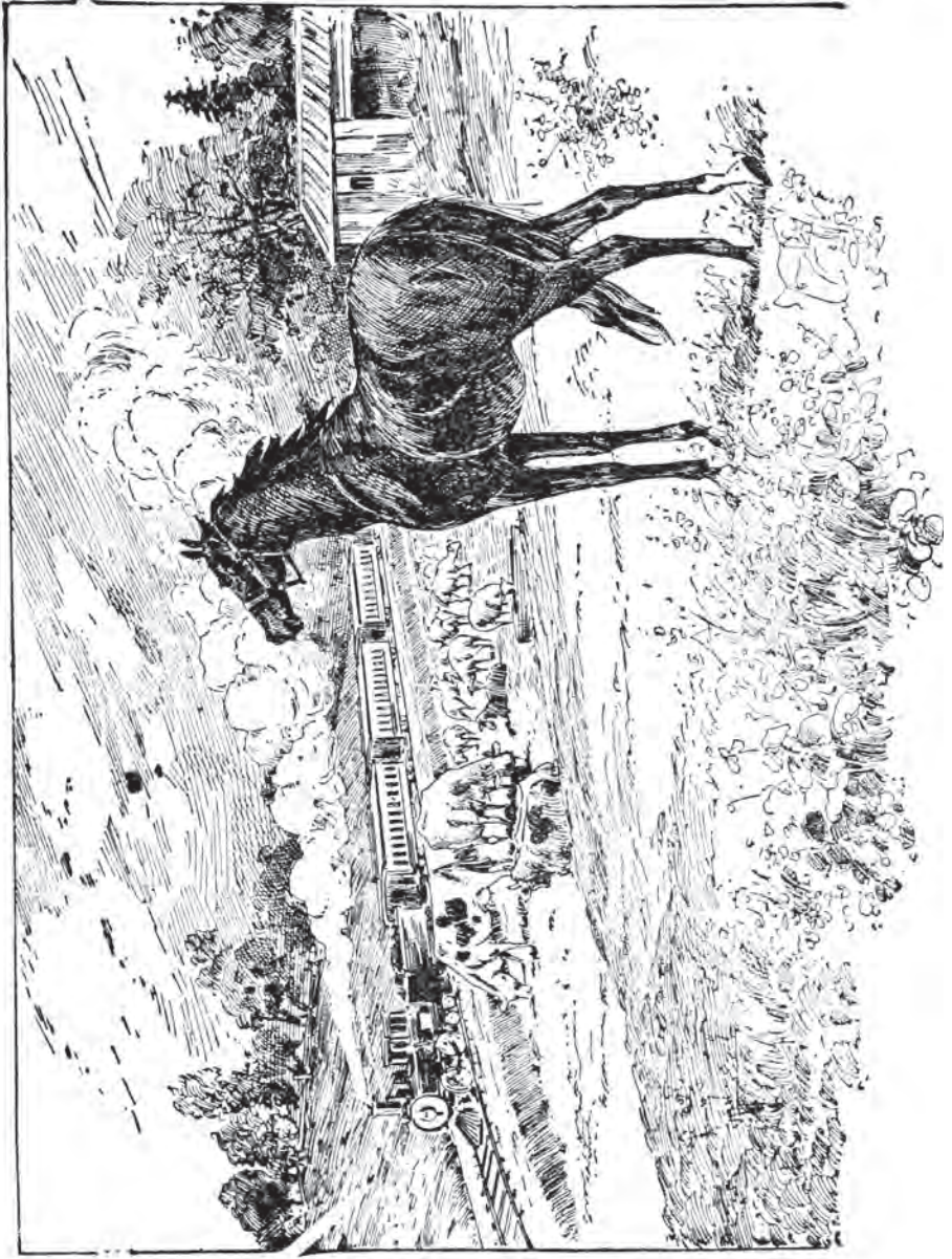
“SNORTING WITH ASTONISHMENT AND FEAR.”