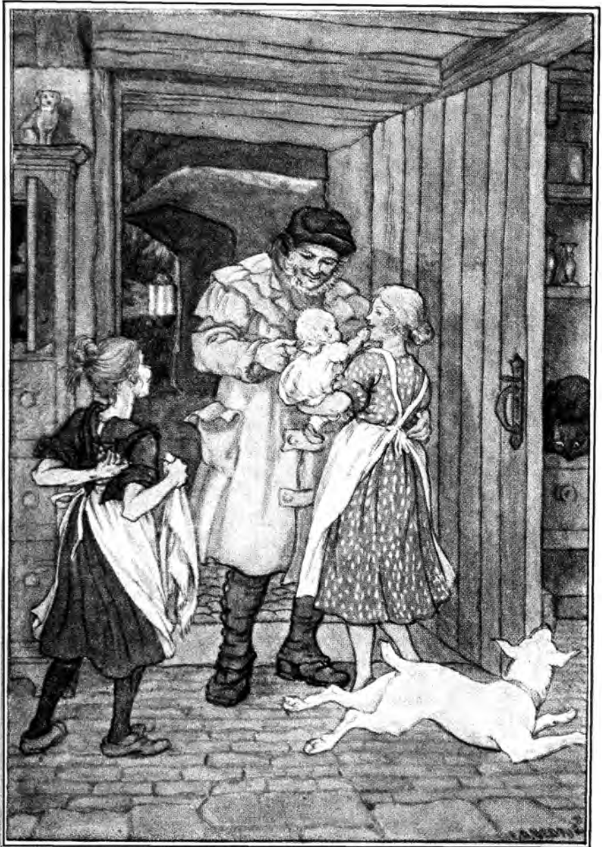
A LIVE BABY THERE WAS IN MRS. PEERYBINGLE'S ARMS