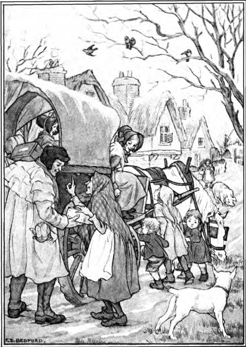
INEXHAUSTIBLE DIRECTIONS ABOUT THEIR PARCELS.