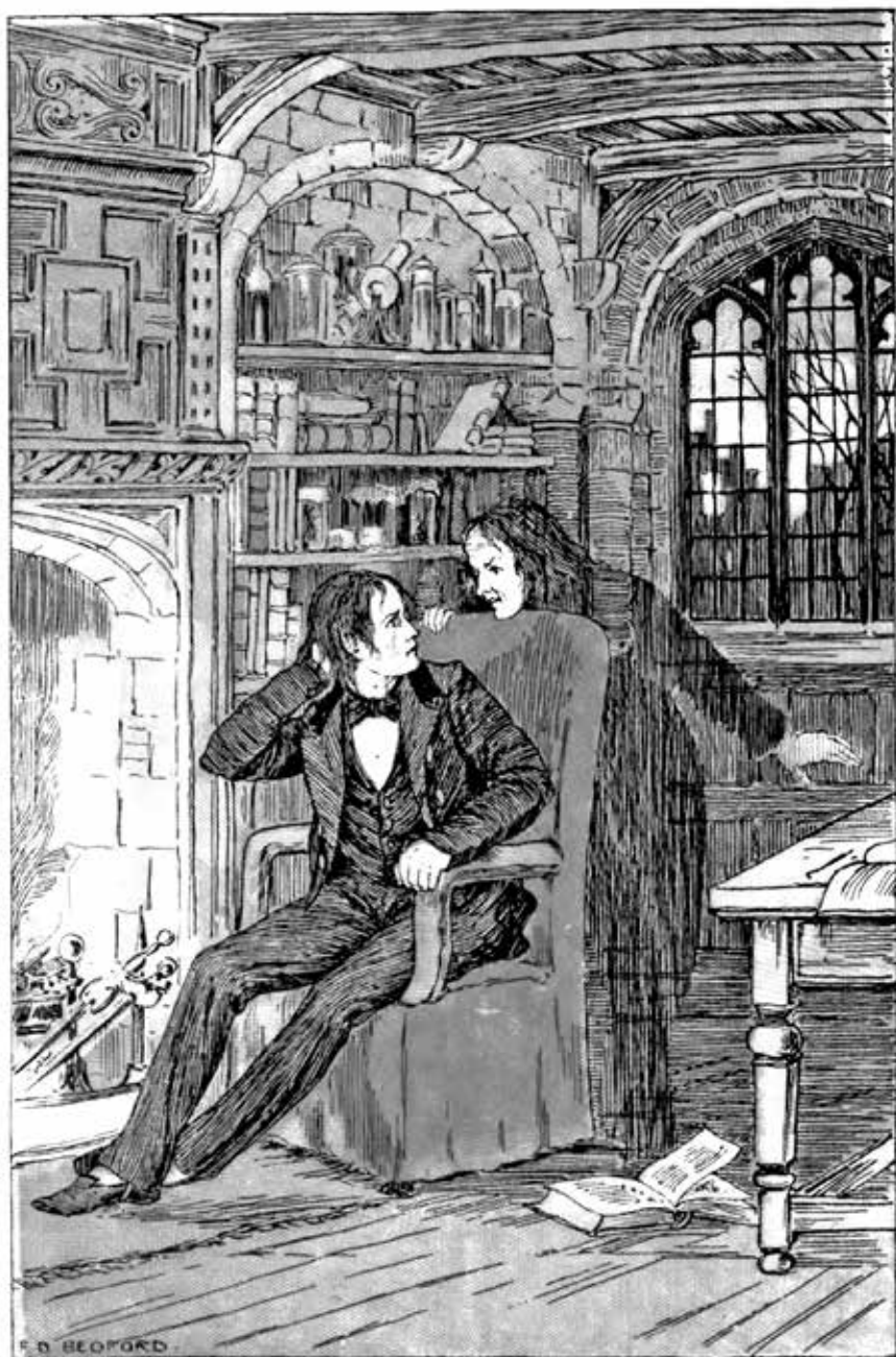
AN AWFUL SURVEY.